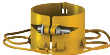
Type 452 Cable Wall Cleaner - Hinged